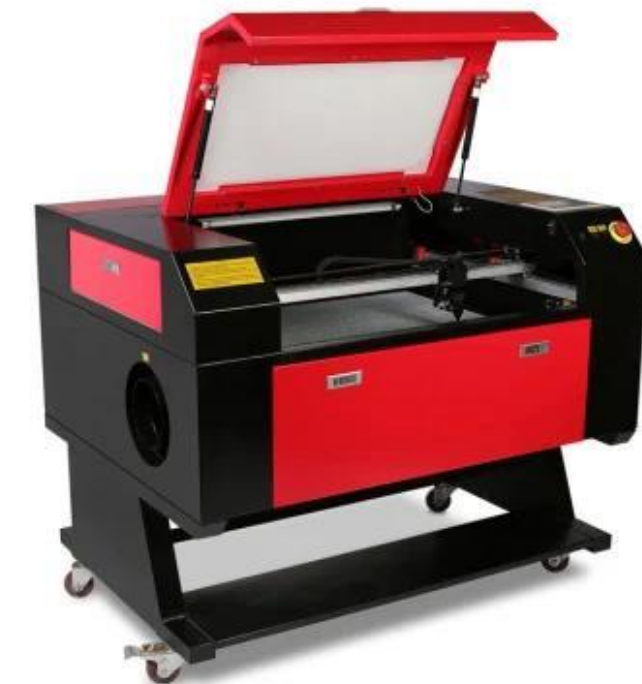
ACRYLIC LASER CUT M/C