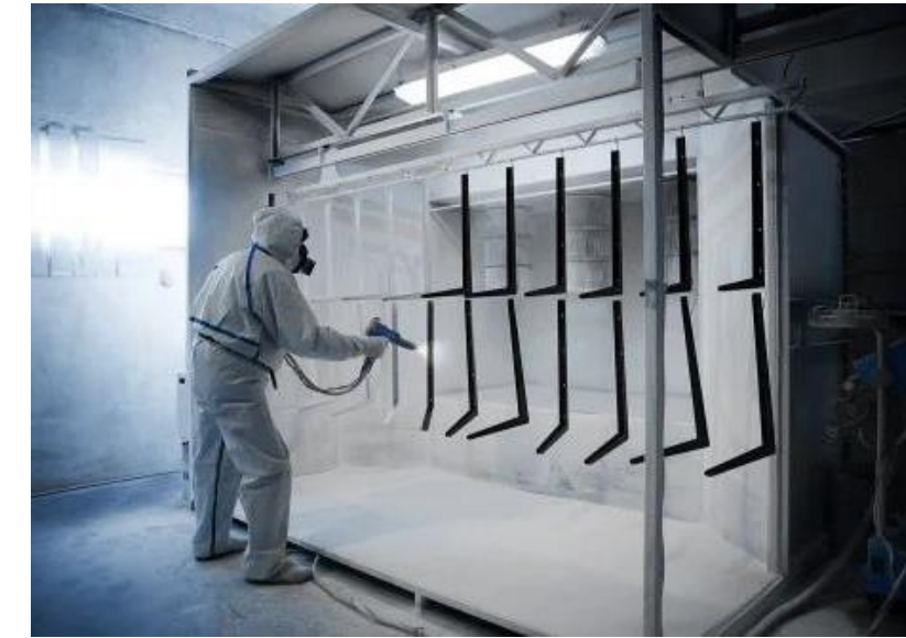
POWDER COATING PLANT