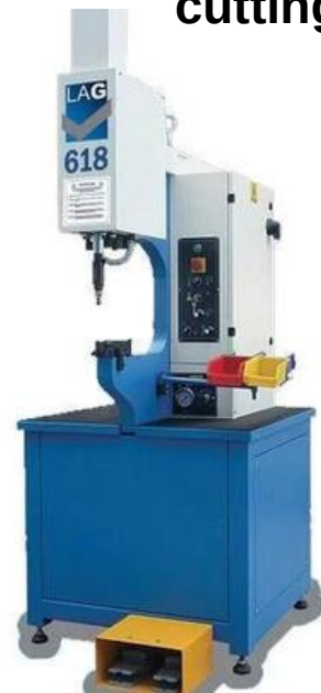
PEM HARWARE FITTING MC

Our laser cutting systems enable us to precisely cut metal sheets with speed and accuracy. Whether it's intricate designs or complex shapes, these machines deliver clean cuts with minimal waste, optimizing material utilization and production efficiency