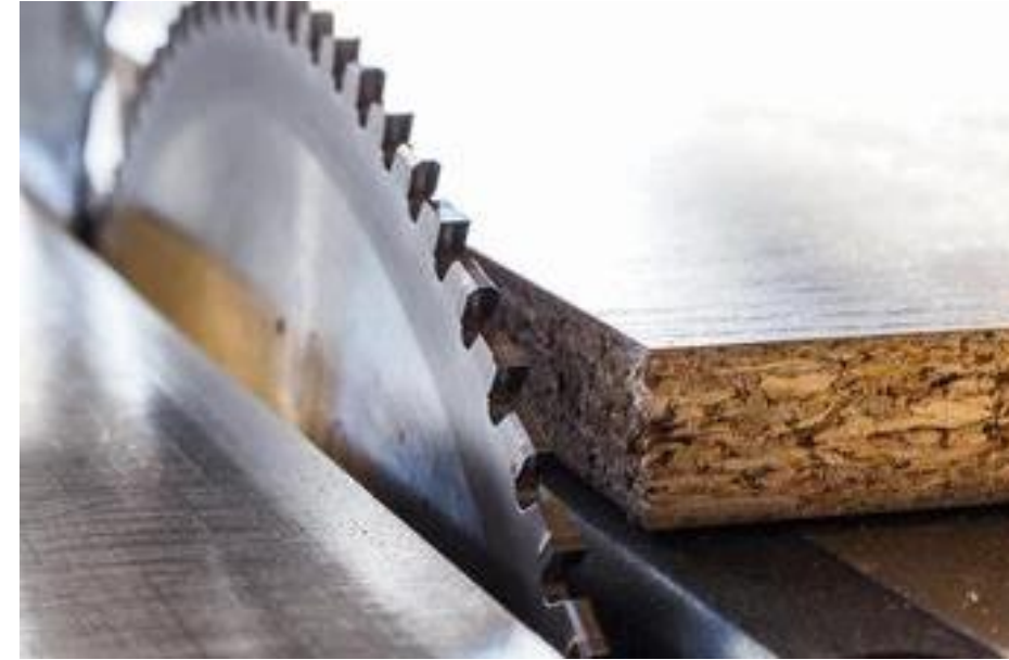
WOOD PANEL SAW