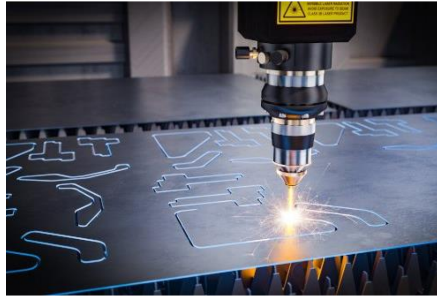
CNC Metal Laser cutting Machine