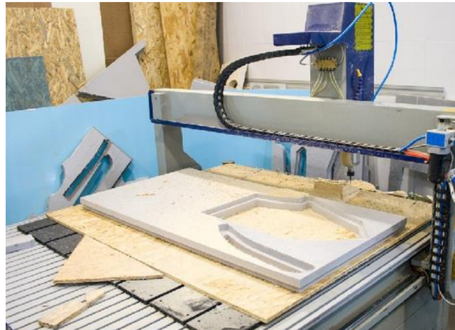
CNC WOOD ROUTER 9KW