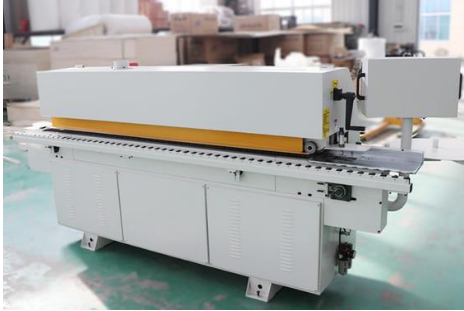
CNC EDGE BENDING