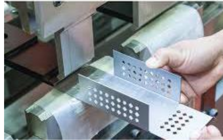
CNC BENDING 100TN & 25TN